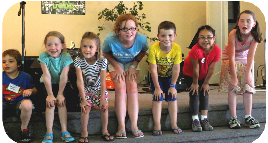
Children sharing their talents at the 2015 week of convention.